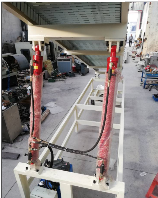
Hydraulic device pic3